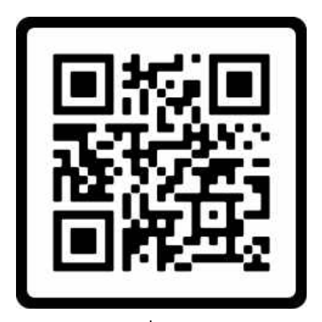
www.change.org Protect Penticton's Naramata Bench

In addition, there are currently two adjoining properties on the market sacrificing even more of our environment for a high density development. One is a 90 acre parcel adjacent to Three Blind Mice and the other is a 72 acre "nature lovers paradise" that are both offering "vast potential for a further high density subdivision". This would be the beginning of the end of the Naramata Bench as we know it.