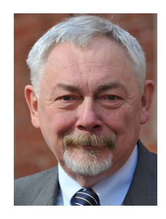
Jacek Majchrowski Mayor of Krakow

The profound historic significance of Bush's behaviour in Poland can not be over-emphazied. G.W. Bush's grandfather, Prescott Bush, was immersed in business dealings with the Nazis and deployment of I.B.M's technology - the Hollerith machine - which used punch cards to keep track of trains and