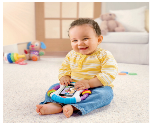
Fig. 3. An iPad placed within a rattle. Note the device is immediately over the boy's testicles.

Digital dementia also referred to as FOMO (Fear Of Missing Out) is a real concern. A science publication's review