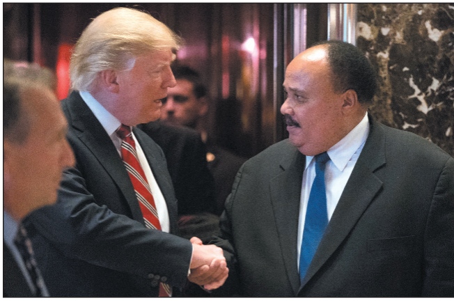
President-elect Donald Trump shakes hands with Martin Luther King III, son of Martin Luther King Jr. on Monday at Trump Tower in New York.

NEW YORK (AP) — Days before taking office, President-elect Donald Trump attempted to navigate the fallout of his flap with a civil rights leader and colleague of Dr. Martin Luther King Jr. while also losing a member of his incoming administration to accusations of plagiarism. Trump on Monday met with one of King's sons on the holiday marking the life of the slain American icon just days after the president-elect attacked Rep. John Lewis on Twitter. Lewis and the elder King were among the Big Six leaders of the civil rights movement of the 1960s. Trump accused Lewis, D-Ga., for being "all talk" after Lewis questioned the legitimacy of Trump's election. The president-elect also advised the veteran congressman to pay more attention to his "crime ridden" Atlanta-area district. Trump's comments drew widespread criticism and have done little to reassure those uneasy about the transition from the nation's first black president to a president-elect still struggling to connect with most nonwhite voters. Martin Luther King III downplayed the slight, saying that "in the heat of emotion a lot of things get said on both sides." King, who said he pressed Trump on the need for voting reform to increase participation, deemed the meeting "constructive." King