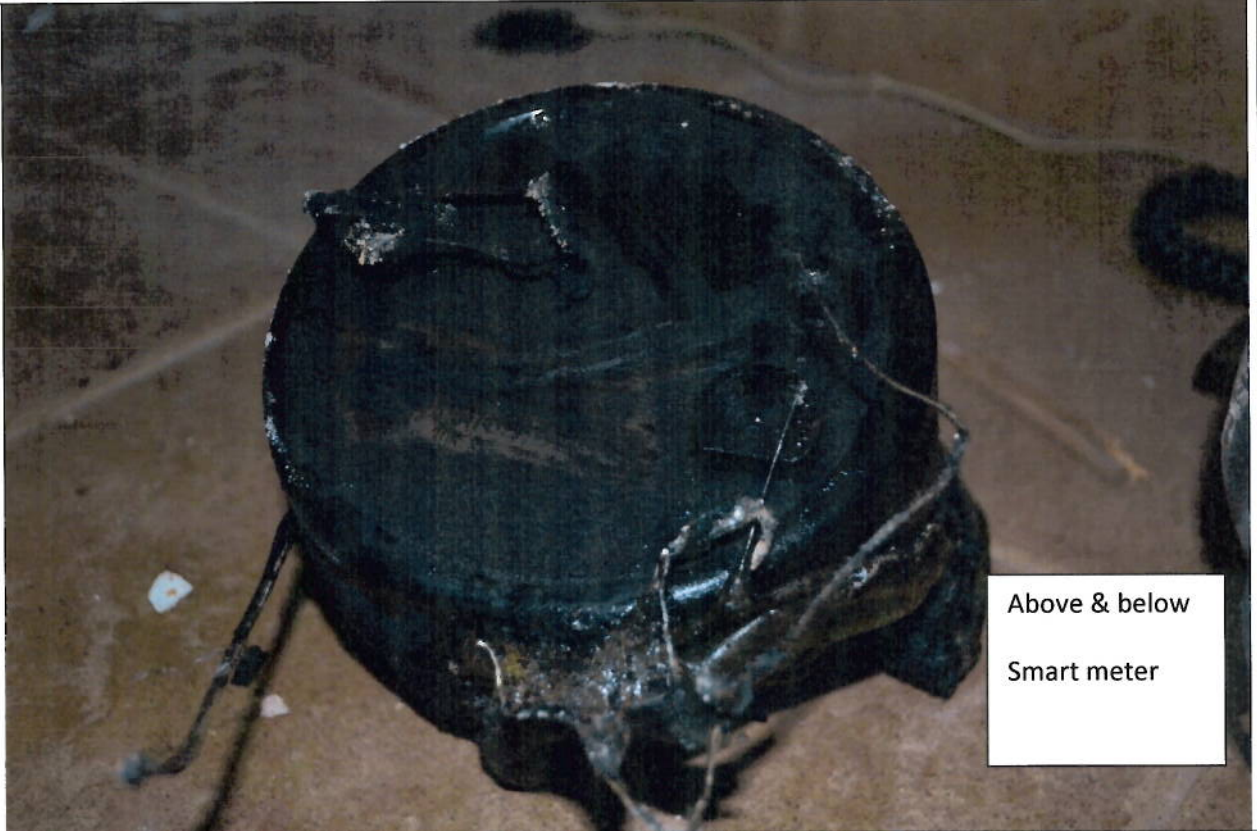
Above & below Smart meter