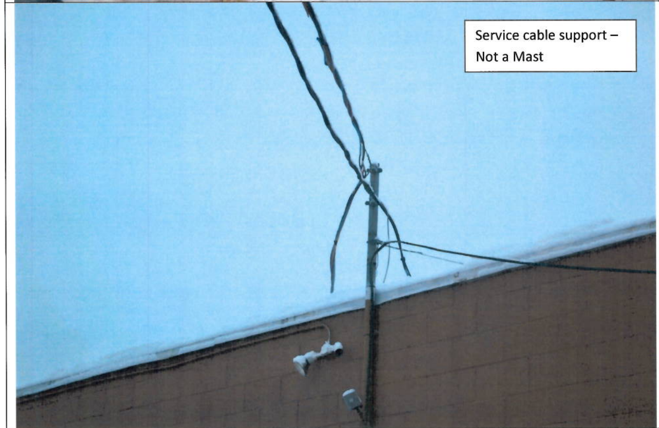
Service cable support – Not a Mast