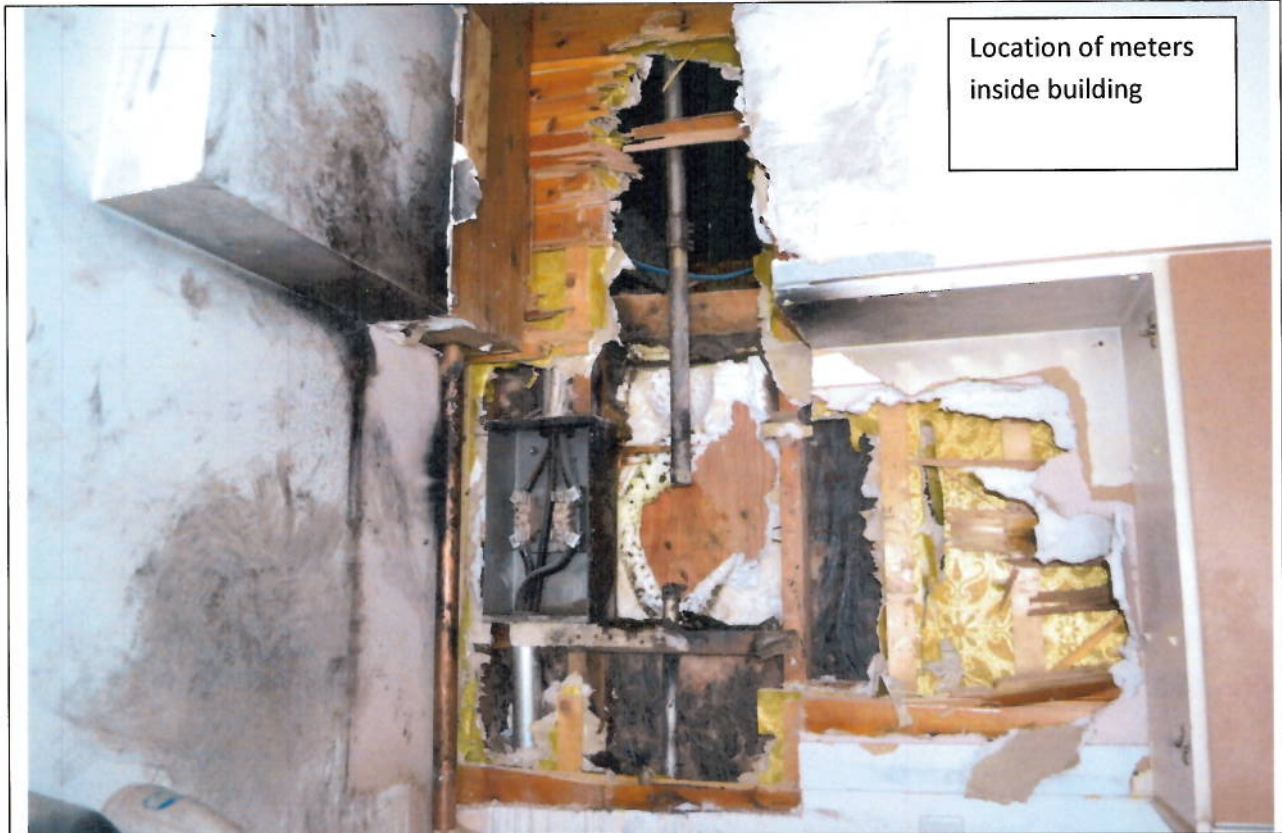
Location of meters inside building